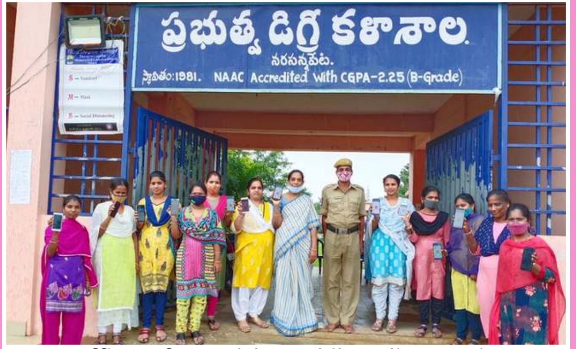
Officers from Disha Mahila Police station