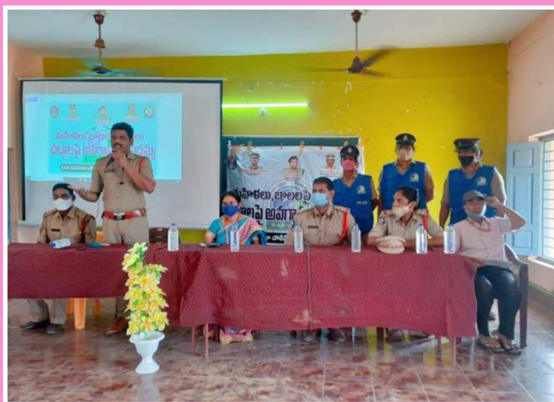
Resource Person : Officers from the Police Department